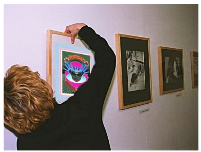
Get Them on the Wall