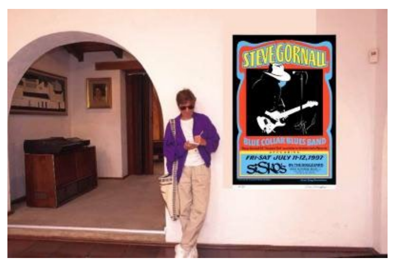
Posters Liven up Businesses

While I tend to be pretty sparing as to how many posters I want to put on any given wall, this is not always the most successful approach. Many folks like to fill every available space with posters and they look pretty great at that. Here are three views of San Francisco's S.F. Rock, one of the main stores for posters on the West Coast. As you can see, the walls are filled, but it is all very tastefully and effectively done. There is a lot to see.