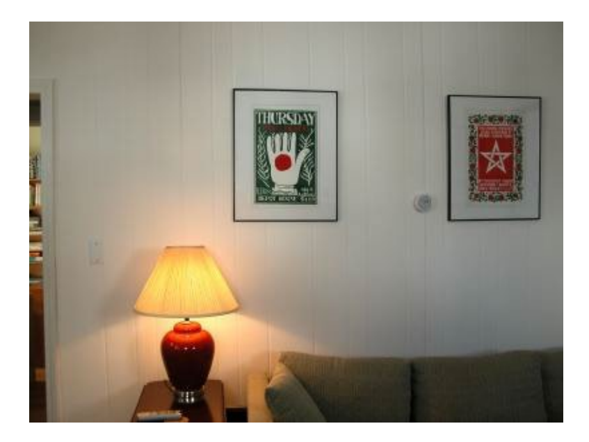
My Own Posters

At some point, I decided to take down the Klee prints, the O'Keefe, and the little batiks we had picked up at the flea markets and replace them, at least in some rooms, with rock and roll art - concert music posters. For one, I had to have some of the concert posters that I had designed and printed for my own band, back in the sixties, on the wall.