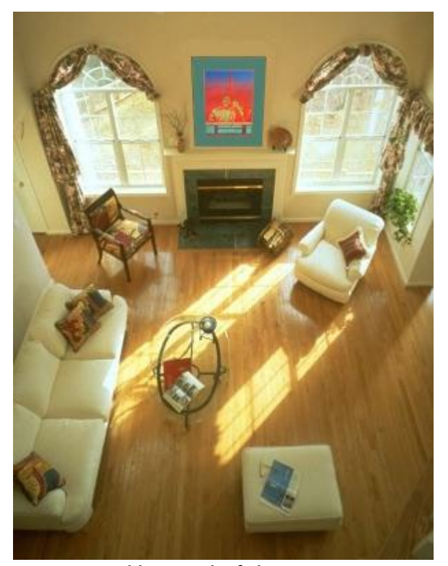
A Moscoso Adds a Touch of Elegance